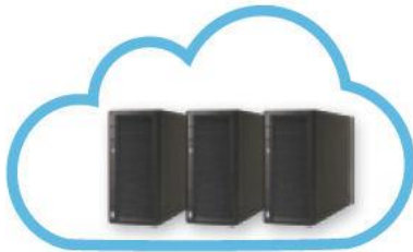
RISCO Cloud Server